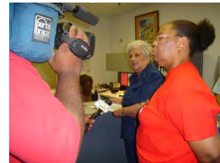
At City Hall, saving gutted homes from being demolished.