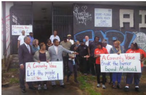
Press Conference for Medicaid Expansion with Elected Officials

A Community Voice (ACV) was founded in 2009 by a group of low income African Americans, former leaders of Louisiana ACORN, with over 40 years of community organizing work who wanted to formulate their own group to continue to fight for equity in rebuilding the lower income neighborhoods post-Katrina and fight on Statewide issues such as Health Care, lead poisoning and affordable housing. These leaders work towards building power for lower income families.