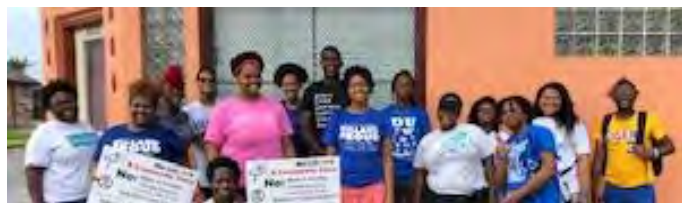
Training New Generations of Community Organizers