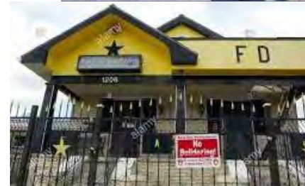
"No Bulldozing" campaign gave displaced residents a way to fight back & stopped the City from demolishing at will. (Fats Domino's home).