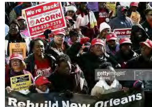
Post-Katrina Protests in DC won over 5 Billion in Recovery Funds