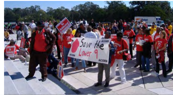
Rallying in Baton Rouge for the Right to Return