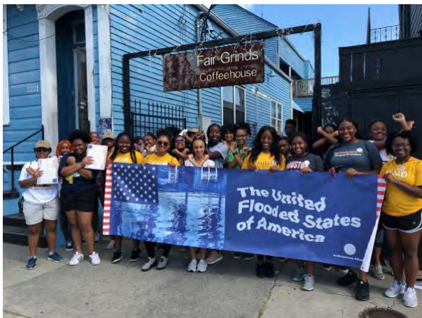
Outreach on Flooding & Climate Change