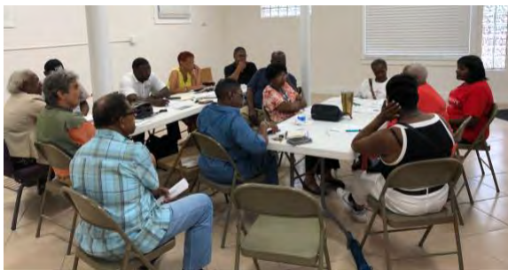
Members Developing Campaign Strategies