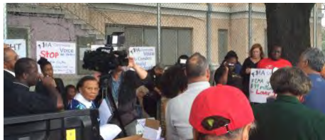
Protest to Save the Historic Armstrong School Building